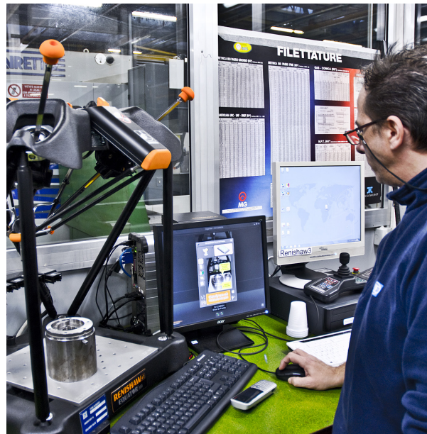
An operator measures a part on Equator.

However, that is not all. In addition to process control of a single part, it is possible to switch quickly to measuring other parts or to quickly change the measuring program to cope with design changes to existing parts. The measuring results from the Equator gauge can also be used to make changes to tool offsets on the machine tool, and close the loop to provide automatic control of the process.