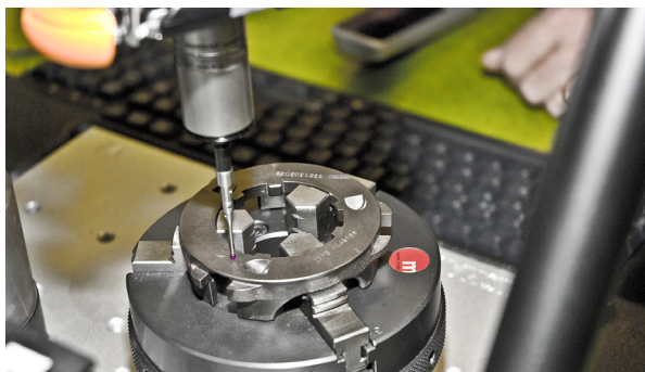
Equator measuring a ZF Marine part