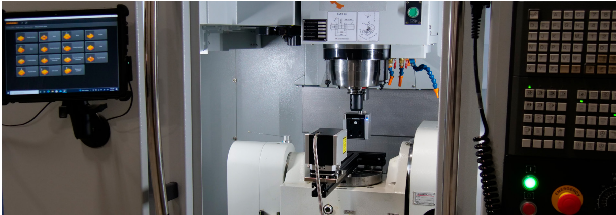
KES uses the XM-60 on both its CNC machine tools and CMMs to perform volumetric compensation

Volumetric compensation is a relatively new process in the United States, but we have had great success in the past two years. We can now better support our customers and provide solutions that they demand to ensure machine precision. For example, we're now seeing some of our customers installing these solutions onto new machines and performing volumetric compensation during installation, ensuring machine accuracy from the very beginning.