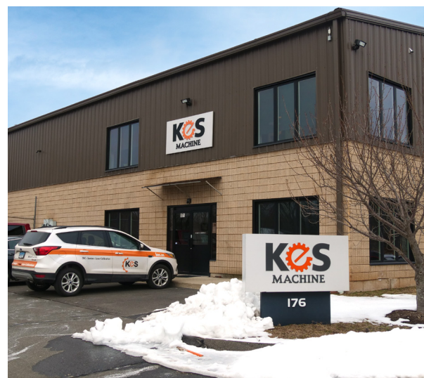
KES Machine facility in Connecticut, USA

While the company initially focused on CNC service work, in 2008, it invested in its first Renishaw ML10 laser system and began developing its calibration services. Based in Newington, Connecticut, the company works with machine tool builders, importers, distributors and end-users, primarily in the aerospace, defence, nuclear and medical sectors across the region.