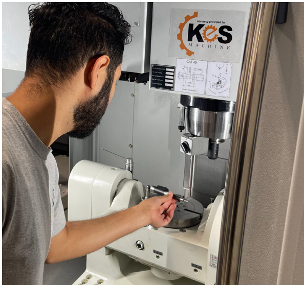
Renishaw's QC20 ballbar system