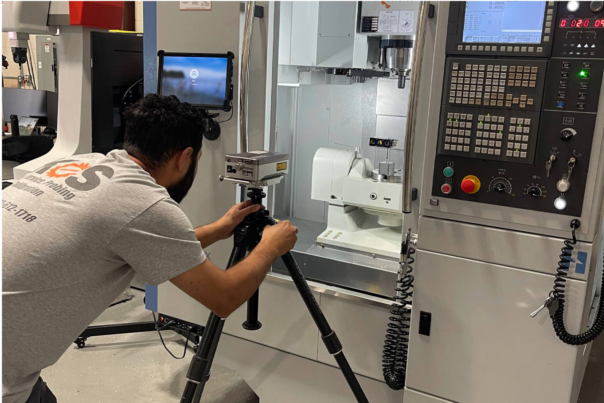
Renishaw's XL-80 laser system on a CNC machine tool