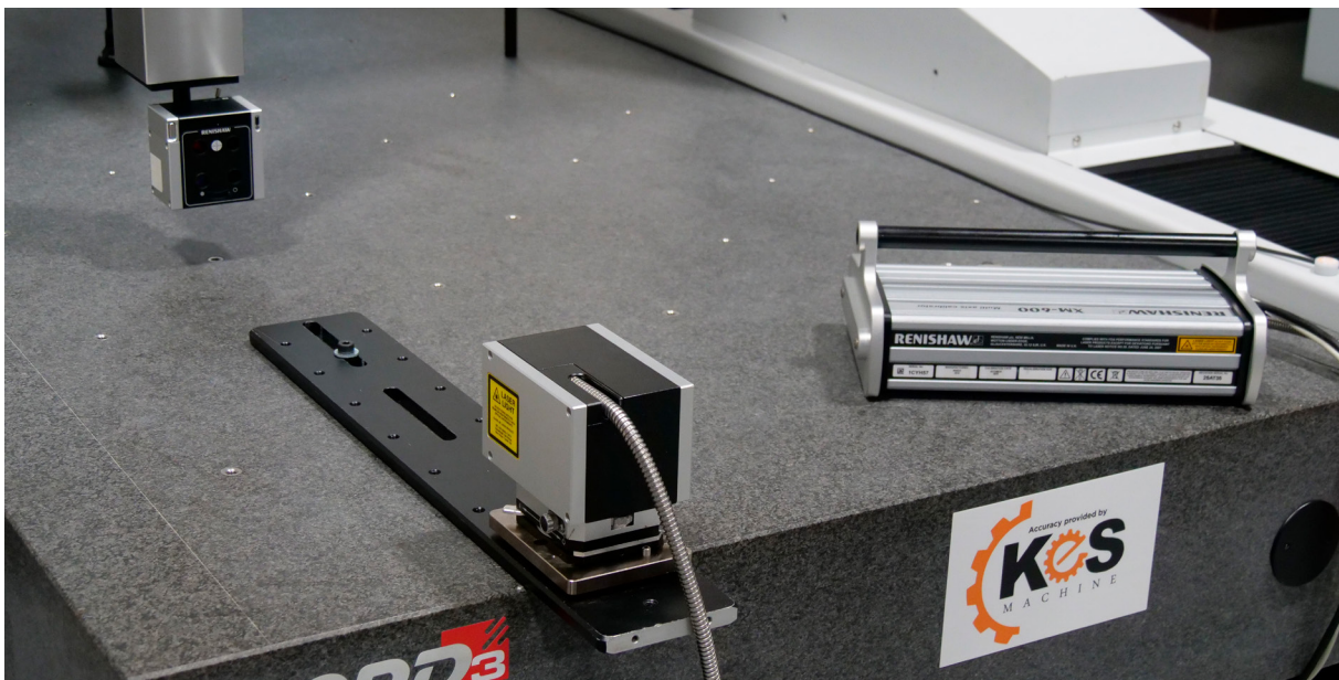
Renishaw's XM-600 multi-axis calibrator on a CMM