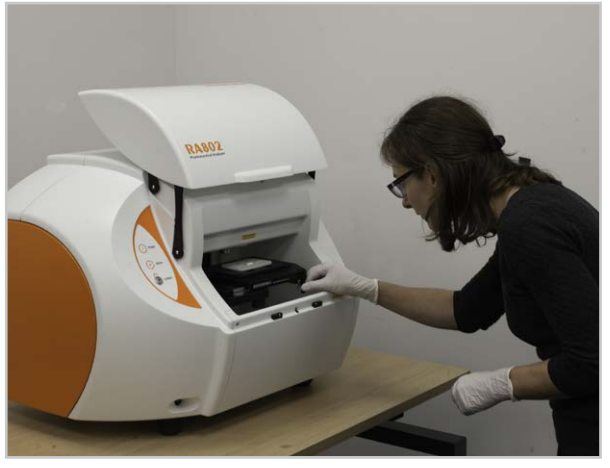
The compact, easy-to-use RA802 Pharmaceutical Analyser

When generating Raman images, chemical components can be segregated using false colours and characterised using particle statistics. This gives users a tool to understand how each component is distributed throughout the sample and rationalise real-world performance between different batches and formulations.