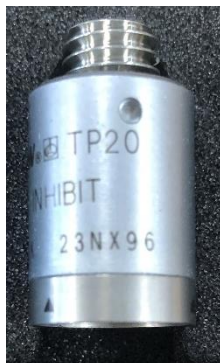
Previous TP20 engraving font (shown on a non-inhibit body)

The laser engraving on the standard TP20 bodies has being updated to a bold font. This change has already been cut-in and units are being shipped. The Non-inhibit and Fixed polarity versions will be not be changed at this time, pending a further change to update the compliance markings. The engraving change is shown in the images below.