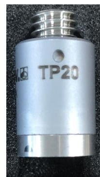
New TP20 engraving font (shown on a standard body)

If you have any questions or comments on this bulletin, please contact CMMSupport@renishaw.com