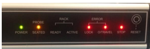
Figure 3 ACC2-3 front panel LEDs