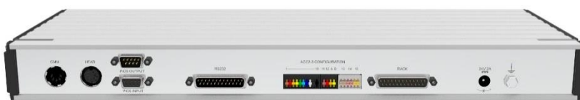
Figure 2 ACC2-3 rear panel