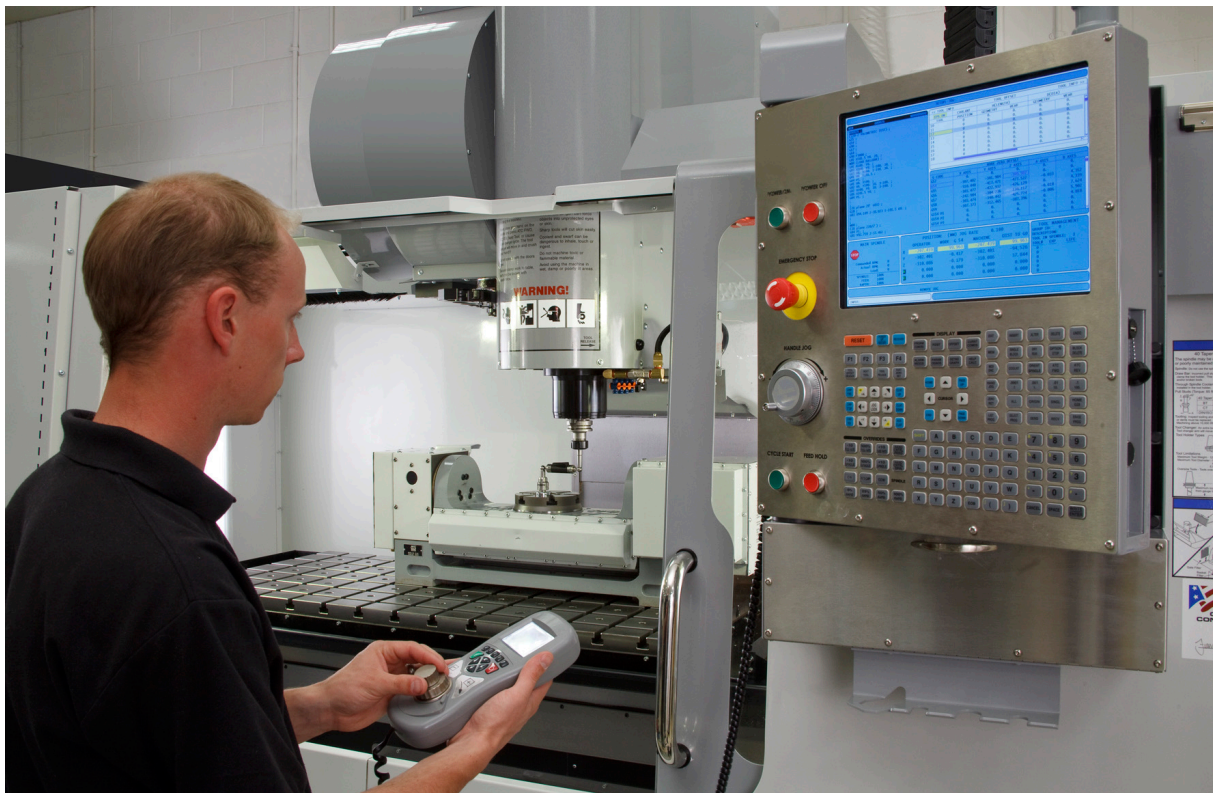
Performing a QC20-W ballbar test on a CNC machine tool

The Bluetooth word mark and logos are owned by Bluetooth SIG, Inc. and any use of such marks by Renishaw plc is under license. Other trademarks and trade names are those of their respective owners