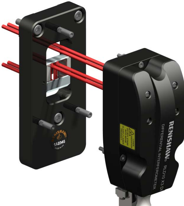
Figure 1: RLD10-X3-DI differential interferometer and periscope assembly