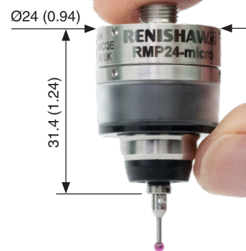
Dimensions given in mm (in)

* Performance specification is tested at a standard test velocity of 480 mm/min (18.89 in/min) with a 10 mm stylus. Significantly higher velocity is possible depending on application requirements.