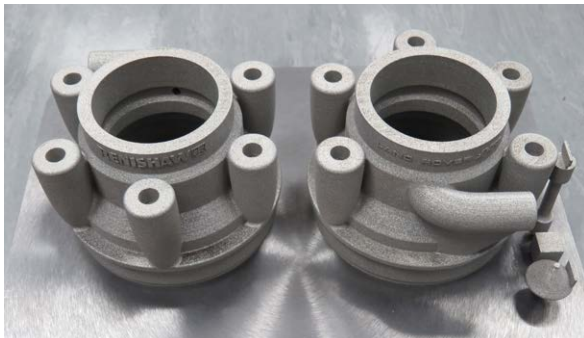
Land Rover BAR demonstration metal AM manifolds on the build plate

The design of the manifold is created in CAD software by Land Rover BAR. Renishaw produces its own build preparation software called QuantAM. We take the CAD file from Land Rover BAR, orient it, rotate it, support it and slice it up into multiple layers. Once we've done that we can send the machine file to the AM system which builds up the part using a high-powered laser and there's room to iterate and make design improvements.