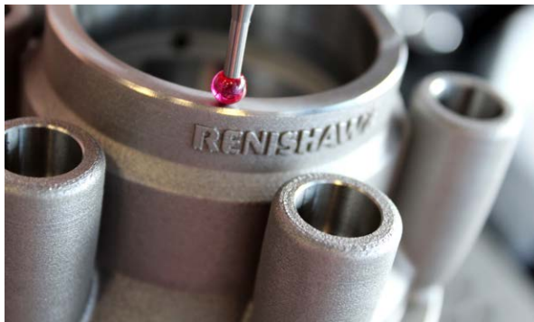
Demonstration Land Rover BAR metal AM hydraulic manifold

Before metal 3D printing technology, all the parts in the hydraulic system would have been made using a subtractive manufacturing method. Traditionally, hydraulic block manifolds are manufactured from an aluminium alloy or stainless steel billet which has been cut and machined to size. This is followed by drilling at 90 degree angles to create the flow pathways. Specialised tooling is often needed due to the complex drilling that is required. Passages require blanking plugs to properly direct flow through the system.