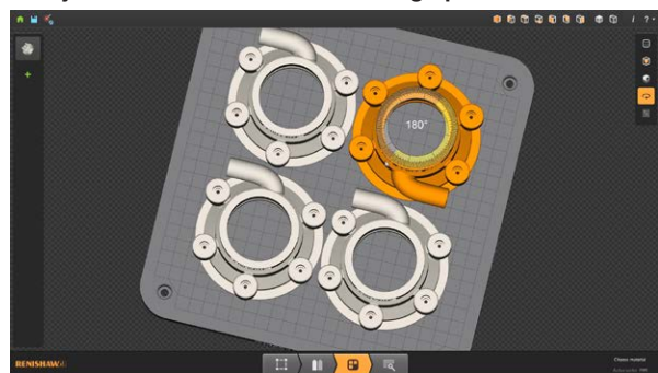
Land Rover BAR demonstration metal AM manifolds in QuantAM software