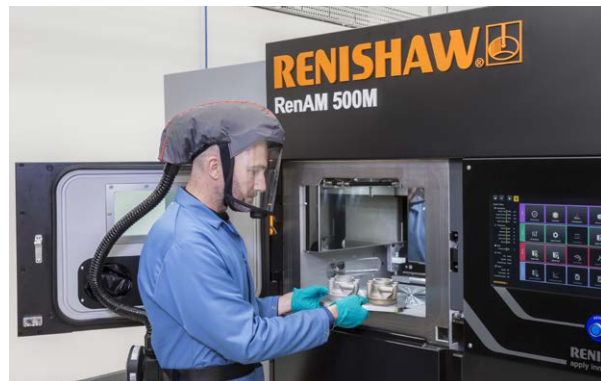
Removing Land Rover BAR demonstration metal AM manifolds from Renishaw RenAM 500M metal additive manufacturing system

Once the build is complete any excess powder is brushed away whilst still sealed within the system. The build plate carrying the part may then be removed from the system ready for finishing using post processing techniques. Most metal parts are removed from the build plate using wire EDM. They may then require some surface finishing and heat treatment. Machining is used to add in threads and in areas where high tolerances are required.