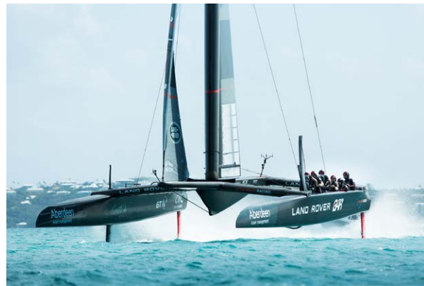
The R1 at speed in Bermuda

Another benefit is the significant weight saving against a traditional block manifold. A traditional block manifold is produced using a subtractive process. Material must be cut away which can leave surplus, non-essential weight and an over specification wall thickness.