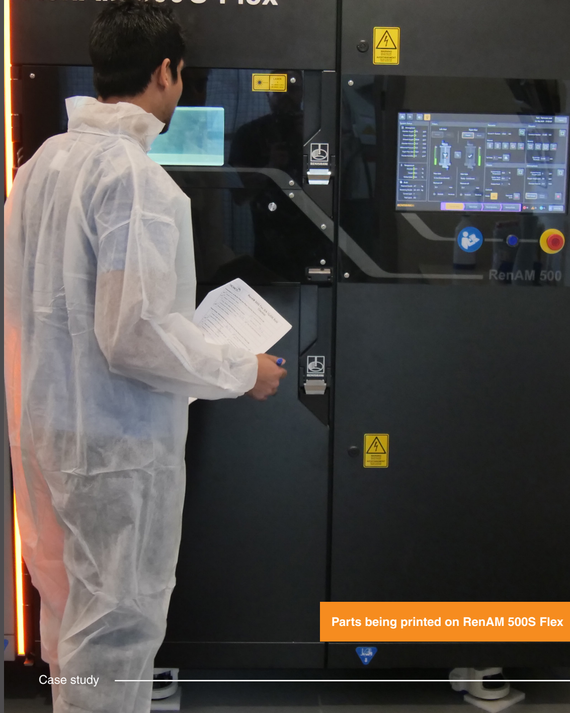
Parts being printed on RenAM 500S Flex