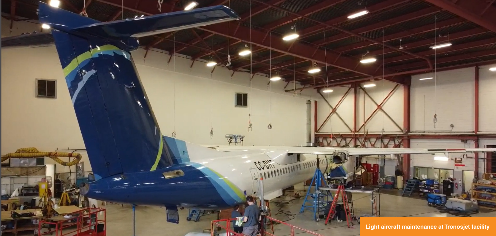
Light aircraft maintenance at Tronosjet facility

With AM still a relatively new technology, Tronosjet knew it would need to demonstrate the quality, strength and reliability of printed parts to the FAA and its regulatory groups, comprised of material scientists, aerospace engineers and other airworthiness specialists.