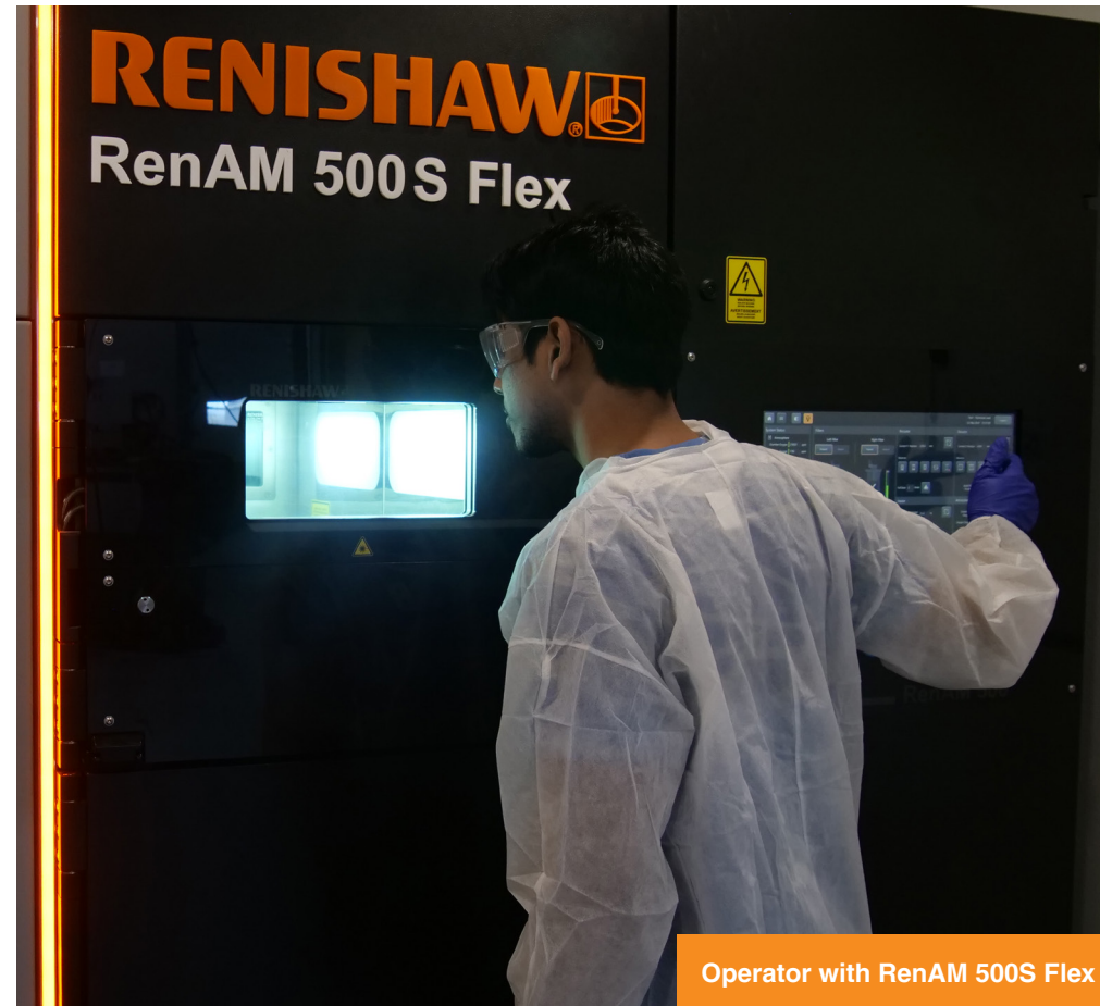
Operator with RenAM 500S Flex