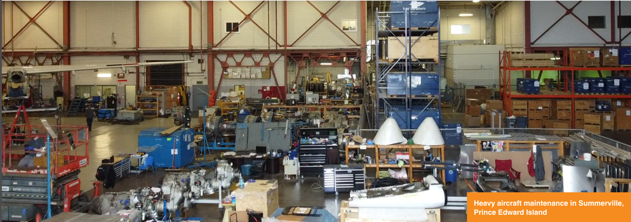
Heavy aircraft maintenance in Summerville, Prince Edward Island

In 2016, the company founded its advanced manufacturing division, established to use AM to produce different aerospace components for its customers. As part of its AM service, its team designs, prints, heat treats, post-processes and metallurgically tests parts to deliver qualified components along with the required certification data. Its manufacturing facility carries approval as an Aerospace Manufacturing Organisation under Transport Canada 561, along with AS9100 approval for design and development. These are industry-recognised standards for quality assurance and risk management for organisations in the aviation sector.