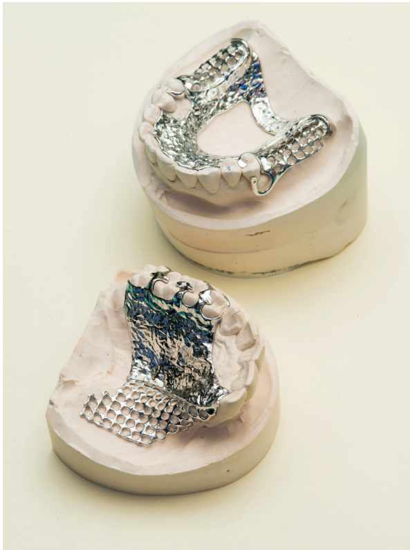
A 3D printed RPD, polished and ready for build up.

So a digital denture framework is nearly a reality but there is still no end-to-end workflow from the design stage through to the manufacture without major manual input.