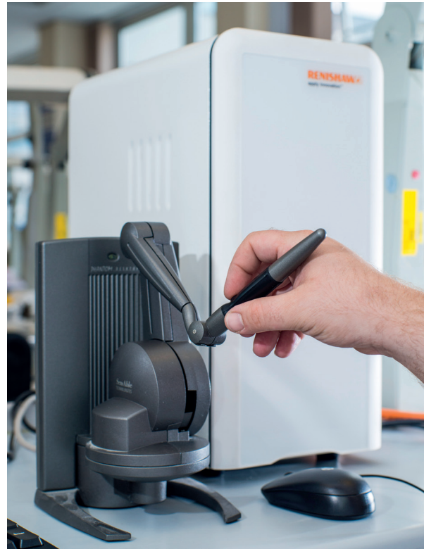
Haptic arm and DS20 scanner