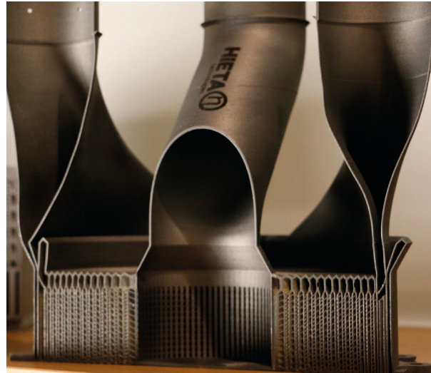
Cross section of SLAMMIT recuperator

Detailed testing showed that the component would meet the requirements in terms of pressure drop and heat transfer. However, this performance was achieved with a weight and volume approximately 30% lower than an equivalent part made by conventional methods.