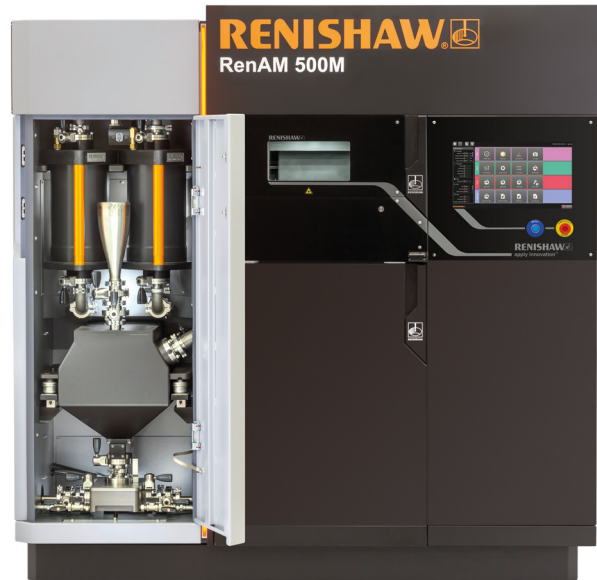
HiETA invested in the more powerful RenAM 500M to enable more cost-effective production of commercial components in low volumes

HiETA chose to partner with Renishaw and to use Renishaw's AM250 system across a range of projects. Firstly, HiETA worked closely with Renishaw to develop specific parameter sets for the production of leak-free thin walls in Inconel down to thicknesses of 150 microns. Both companies produced samples using a variety of settings on the AM250 at Renishaw's facility in Stone, Staffordshire and the system at HiETA's base on the Bristol and Bath Science Park near Bristol, UK. The resulting samples were heat treated and then characterised at HiETA and Renishaw. The test results enabled the companies to confirm the optimum parameters on the machines for thin-walled structures and also allowed HiETA to develop a design guidebook with parameters for heat transfer in heat exchangers manufactured using laser powder-bed fusion technology.