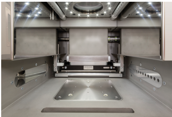
Build chamber, RenAM 500M metal additive manufacturing system

The third challenge was to use the knowledge and experience developed to move the process from the manufacture of samples and prototypes into low-volume production.