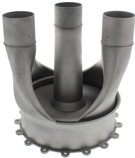
SLAMMIT (Selective Laser Melting of Micro Turbines) recuperator

The first attempt at making a complete product on the AM250 system generated a successful component but needed a build time of seventeen days. Following improvements to the hardware and software, together with optimisation of the process parameters, this was reduced to eighty hours.