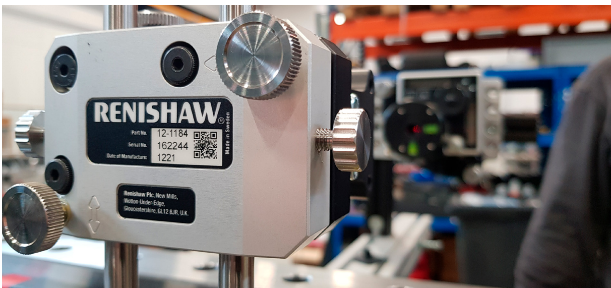
XK10 parallelism kit aligned to the machine's axis

“The XK10 system has enabled us to improve our measurement processes for larger machines,” explained Similä. “During this project we used the XK10 to measure the machine during assembly to check the axes are straight along the axis of travel and measure the machine once installed. With more familiarity of the process, we can monitor external factors that can influence the measurement, such as the effect of environmental changes. We can easily input test parameters into the XK10 display unit and use the versatile fixturing kit to simply check a range of measurements. We have also identified where we can use the XK10 system on future machinery.”