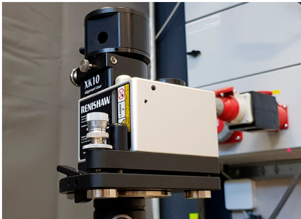
Versatile fixturing solutions provided by the XK10 launch unit