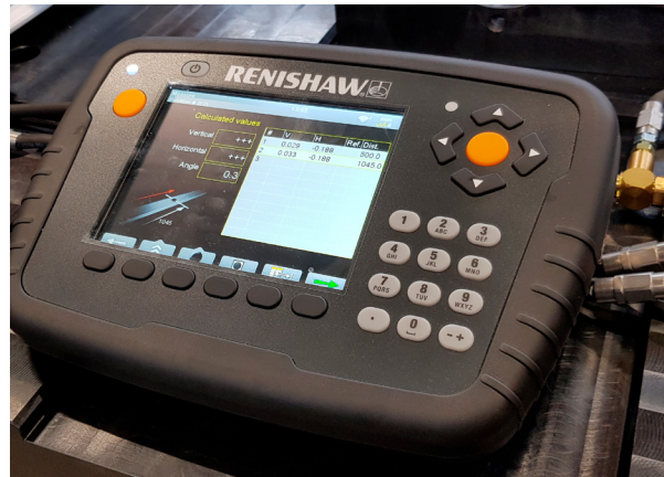
Live feedback with the portable XK10 display unit

For more information visit, www.renishaw.com/xk10