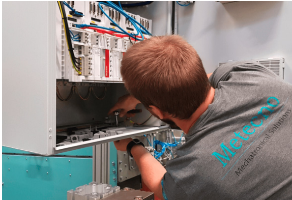
Metecno Oy engineer assembling a CNC machine