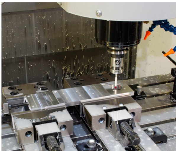
The use of Renishaw's spindle-mounted touch probes has led to dramatic reductions in job set-up time

Jerry Elsy continues, "We bought our first machine tools 15 years ago; 2 Bridgeport knee mills. Then we bought a Bridgeport VMC with spindle and tool setting probes. We then did a lot of research on other machines and HAAS machines stood out." Sewtec now have 11 machine tools, of which 9 are