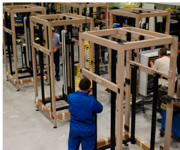
Sewtec machines are supplied globally to manufacturers of confectionery, biscuits, tea and other consumer goods

Unlike many traditional engineering companies, business did not drop during the recession, giving Sewtec the chance to take on many good people who were being let go by other companies, including 3 new machine operators.