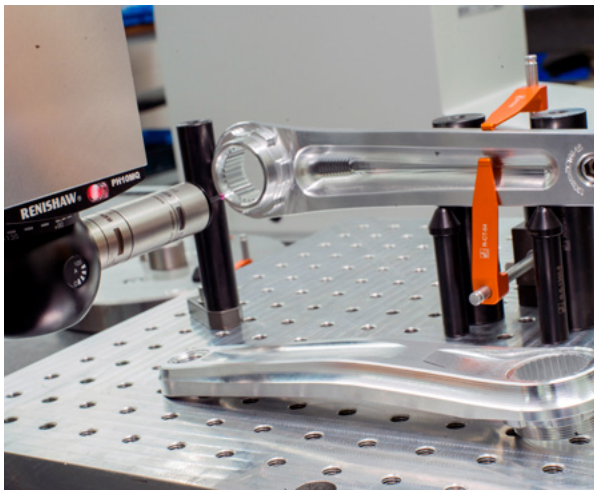
Renishaw PH10/SP25 and modular fixturing contribute to Hope's quality control process

The Hope factory also houses a line of five other Matsuura machines: MAM72 models with smaller, twin pallets, each of which also employs a Renishaw NC4 system. A single Hope Technology operative oversees all five machines, which also run 24-7.