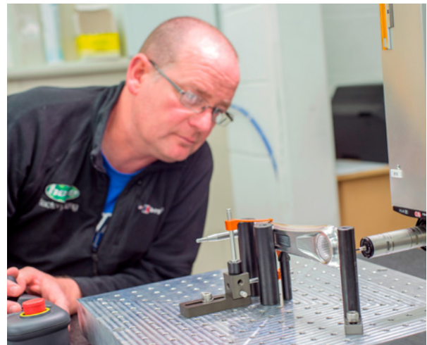
Taking touch points using the Renishaw PH10 motorised head