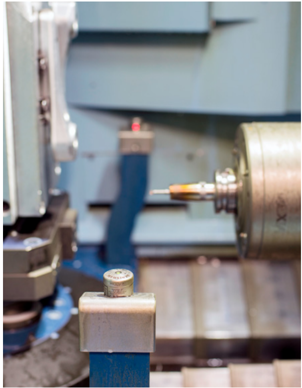
Renishaw NC4 system helping to reduce downtime on Hope Technology’s Matsuura machine