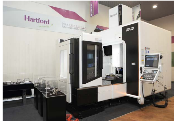
Hartford produces a complete range of medium to large-sized three-axis and five-axis CNC machines