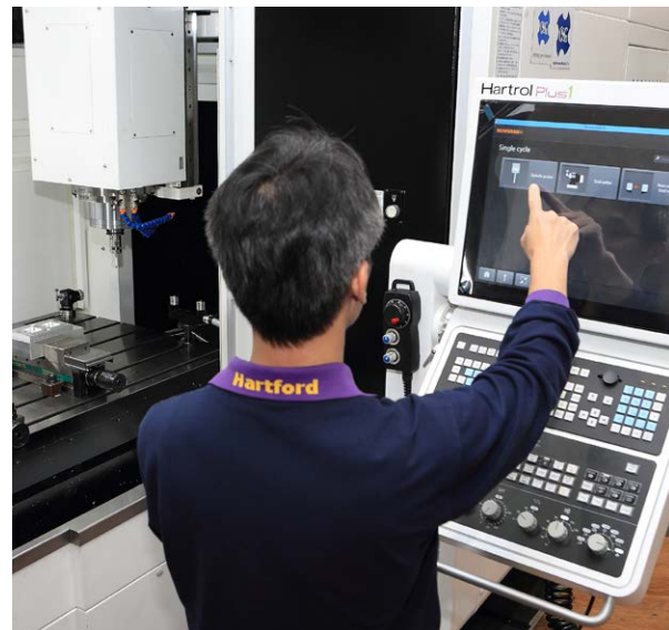
Set and Inspect on-machine app integrated with the Hartrol Plus CNC controller

However, achieving Industry 4.0’s goals of ‘intelligent manufacturing’ and the ‘smart factory’ still relies on accurate and effective process control systems. They need to be easy-to-use and provide sufficient immediate data to enable self-correction and adaptation to any sources of process variation.