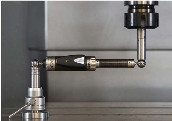
Hartford uses the Renishaw QC20-W ballbar to check machine positioning performance