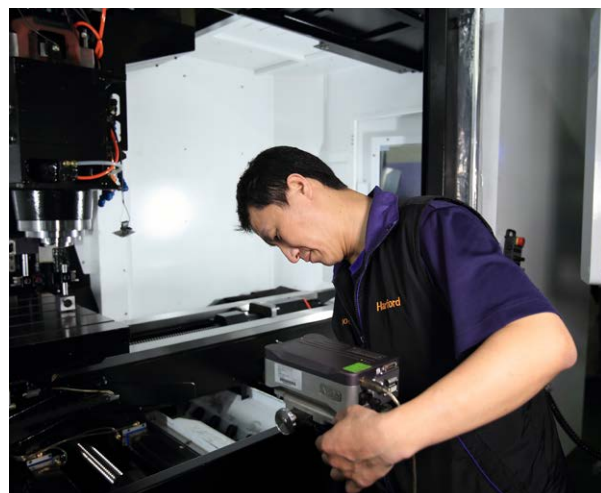
Hartford employee using XL-80 laser interferometer for machine calibration