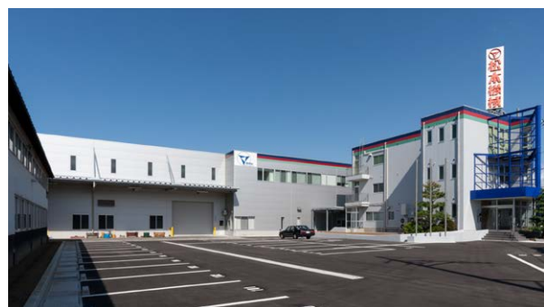
MMK's factory, Japan

Shaped in order to maximise gear surface contact area, thereby reducing adverse surface pressure effects, the OTT worm gear teeth are split into separate right and left parts (shank worm and hollow worm) connected by a span ring.