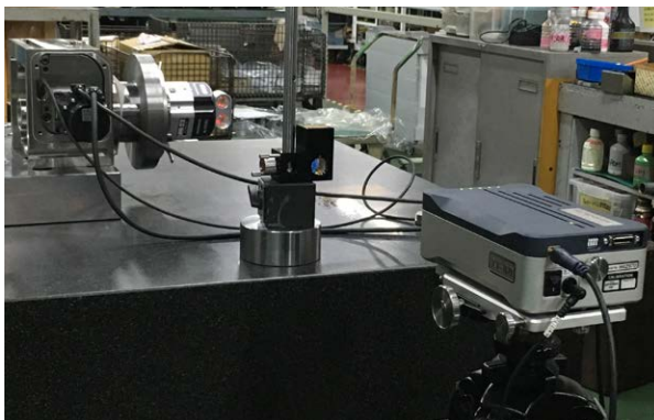
Pre-shipment inspection using Renishaw's XR20-W with XL-80 laser system

At the same time, in an increasingly competitive global market for CNC rotary tables, MMK also wanted to further enhance its product quality inspection processes. Specifically, the company set itself the task of augmenting index angle measurement as a key component of pre-shipment quality assurance procedures.