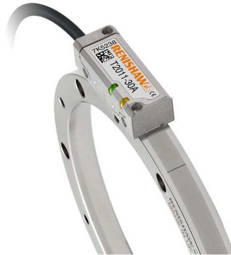
TONiC™ optical incremental encoder with RESM ring scale

For more information visit, www.renishaw.com/matsumoto