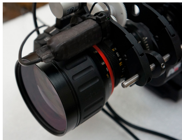
Power Plus' feedback device on the camera head.