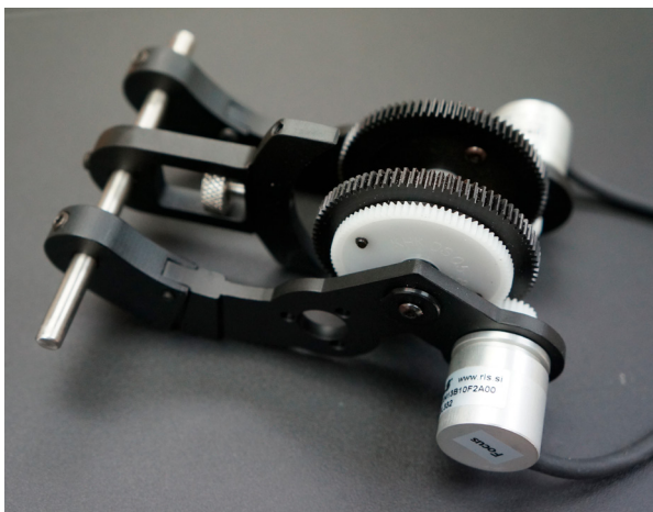
The RE22 provides position feedback from the pan-tilt head allowing stable and precise movement of the camera in the live broadcast.

Simple and fast installation is another trademark of Renishaw encoders. Every readhead features wide installation tolerances and an integral set-up LED, which allows easy installation and removes the need for complex set-up equipment. Renishaw's RESR encoder ring features a patented taper mount which corrects for rotor eccentricity. This simplifies the integration and minimizes installation error. Mr Wong continues: "Installation of the encoder ring could be a headache. However, Renishaw's taper mount design considerably reduces our engineers' workloads and allows us to easily know whether the installation has been successful - just by reading the set-up LED."