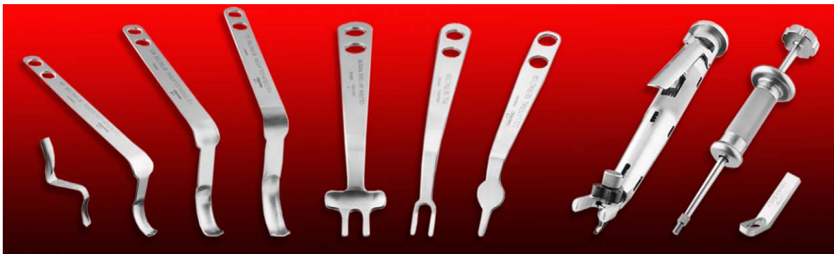
Nemcomed is a division of Aavalign Technologies. The company supplies medical implants and speciality instruments for the orthopaedic, spine and trauma sectors.

The new ballbar design brings the unique advantage of testing in three orthogonal planes through a single reference point, with a single setup, which allows the accompanying software to produce a representative measurement of volumetric positioning accuracy by correlating all three.