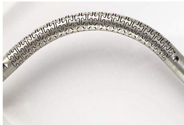
Nemcomed's patented Flex-Shaft is used in surgical screwdrivers, taps and drills.