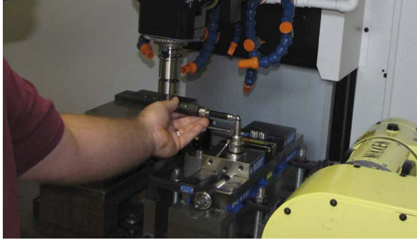
The QC20-W wireless ballbar requires just one set up, and less than 15 minutes, to test the X-Y, Y-Z and X-Z planes.