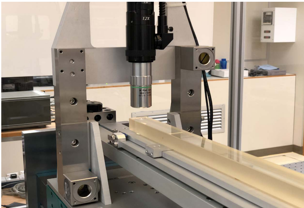
Calibrating a 500 mm glass scale

In the system, the root-sum-square of the Abbe error, caused by the 5 sec of arc in pitch and yaw of the microscope sliding stage for a distance of 100mm can be calculated to be 3.4 \mu\text{m} . In-depth analysis has shown that with the integration of the XL-80 interferometer, this Abbe error figure is reduced by 95%.