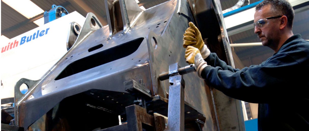
Rare variations in welding and clamping can be picked up by the Renishaw touch probe to guarantee the accuracy of finished machined surfaces

Unlike conventional radio transmission, the RMP60 touch probe system does not operate on a fixed channel. Instead the receiver 'hops' through a sequence of frequencies in the 2.4 GHz band. This unique solution enables even multiple probes to be used with confidence in heavy industrial environments, even those afflicted by debilitating levels of radio interference.