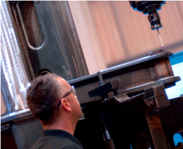
Chassis fabrications are measured before machining and programs adjusted for surfaces out of position