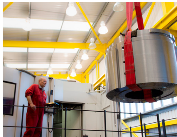
Intoco uses a Mazak INTEGREGX e-1850V to machine components with large diameters