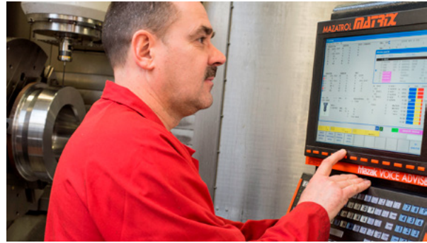
Intoco uses Renishaw's machine tool probing systems on its Mazak INTEGREGX machine tools

"Inspection Plus is great because you can do in-process