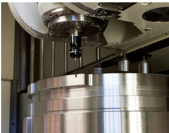
Intoco use Renishaw probing systems to measure large components during the manufacturing process

Mr. Parkins explains: "originally the Mazak Integrex e-650H was delivered without a Renishaw touch probe. However, we required it to machine components up to 1000 mm diameter, which were difficult to measure with conventional inspection equipment. We then contracted Renishaw to fit a touch probe with a radio signal transmission to enable Intoco to inspect and record tight tolerance dimensions."