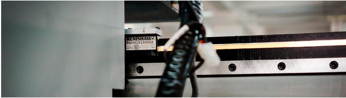
RGH41 optical encoder on the Flora Digital inkjet printer