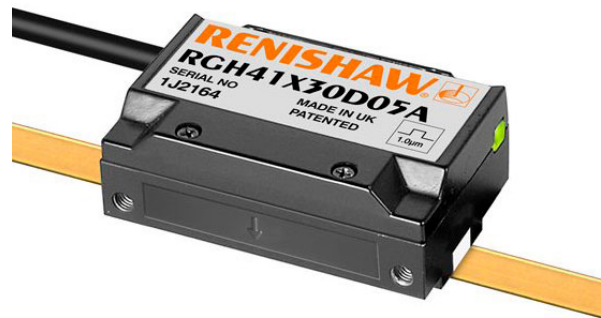
RGH41 optical encoder

Shenzhen Runtianzhi Digital Equipment Co Ltd was listed on the Shenzhen Stock Exchange, China, in 2015. SRDEC is a market leader in commercial inkjet printers for the advertising industry; products include textile printing machines, UV flatbed printers and ceramic-tile inkjet machines. More than half of all production is exported worldwide to over 100 countries and regions. SRDEC is also certified to ISO9001:2000 and a member of the Printing and Printing Equipment Industries Association of China (PEIAC).