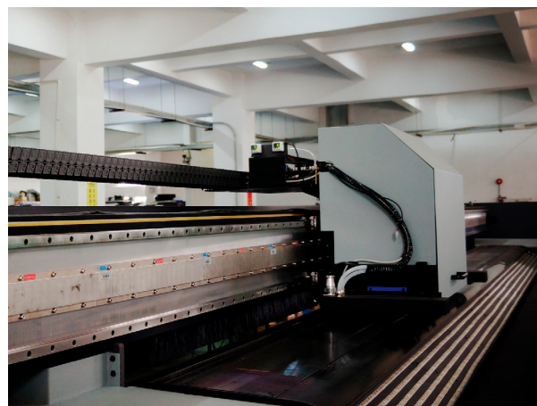
Flora Digital inkjet printer