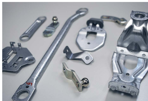
Eponsa produce all the stamped parts for windscreen wiper mechanisms.

“The Equator gauging system could reduce or eliminate quality room waiting times. This is because the Equator system can be used on the shop floor, alongside the machines producing the parts, and with the low purchase cost we can have several Equator gauges positioned where we need them. We plan to have Equator gauges alongside the stamping area and in the area for assembling mechanisms, where they will be particularly important. The speed of operation and measurement capability of the Equator system will ensure rapid, comprehensive and fully automated gauging.”