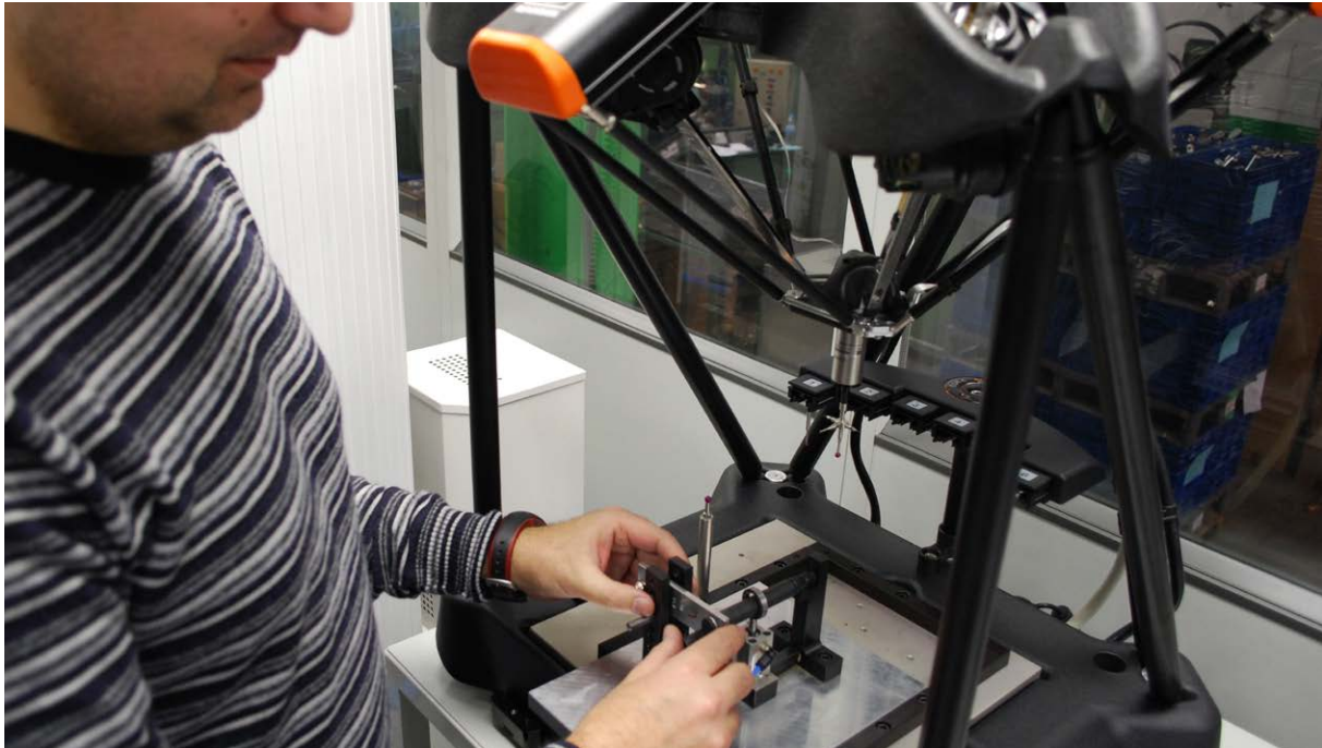
An Eponsa engineer loads a wiper mechanism part onto Equator ready for gauging.