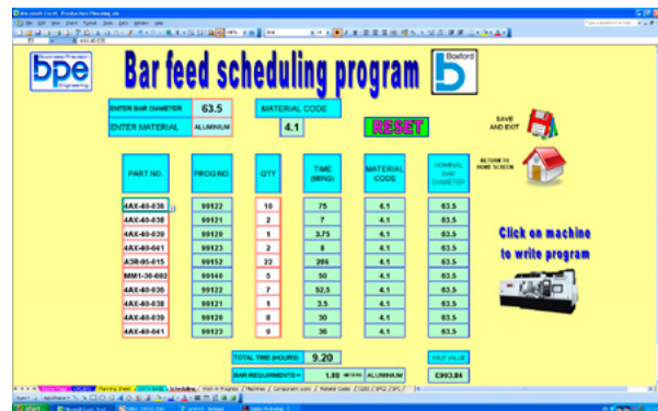
The scheduling system controls quantities, machining programs and setting routines

Components have been re-designed to enable and improve machining on the Integrex. A high capacity 120-tool changer system was purchased with the machine, but even this would not accommodate all the tools that were needed previously, especially when provision has to be made for sister tooling. Steve Randerson gave the designers a far shorter list of tools that could be used to machine all the jobs in all the different materials - a number of changes were made to accommodate this. Not only that, but they also took a far more sensible view on tolerances and surface finishes, with blanket tolerances on surfaces thrown out and each feature closely examined to see what was actually necessary for function and appearance.