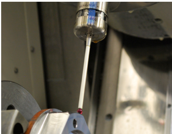
Mazak Integrex multi-axis mill-turn machine with Renishaw OMP400 in the spindle

If it is undersize the billet is rejected before the machine wastes time attempting to cut it. Features on the billet may be measured by the touch probe during the machining cycle,