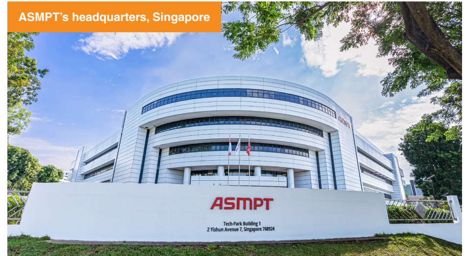
ASMPT's headquarters, Singapore

The Renishaw XM-60 multi-axis calibrator simultaneously measures errors in six degrees of freedom with one set-up. This helps understand and characterise the accuracy and machining capabilities of all processing equipment. This allows efficient allocation of resources, ensuring optimised equipment operation and maximum efficiency.