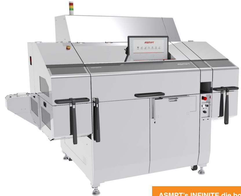
ASMPT's INFINITE die bonder

The ATOM DX encoder directly outputs digital signals from the readhead and integrates all position feedback, onboard interpolation, and optical filtering functions within its miniature package. The readhead is designed to be extremely compact, with a minimum packaged size of 20.5 mm x 12.7 mm x 7.85 mm, allowing for installation in very small spaces without the need for additional connecting interfaces, saving significant space on ASMPT machines. The ATOM DX encoder series delivers excellent performance with a resolution of up to 2.5 nm and advantages such as low Sub-Divisional Error (SDE) and low signal jitter.