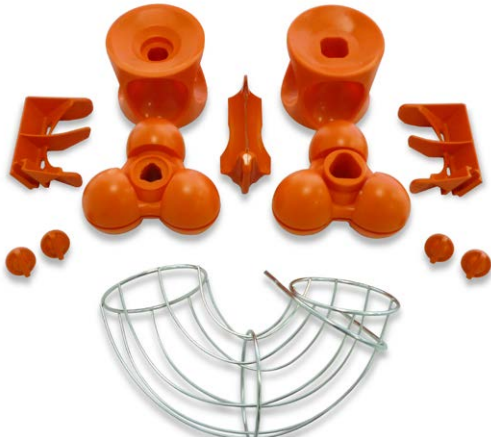
Zumex vacuum cast parts and feeder tube