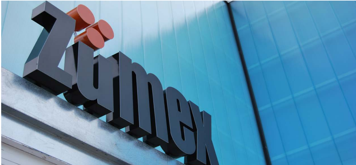
Zumex headquarters, Valencia, Spain