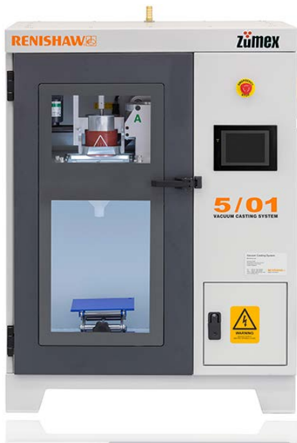
Renishaw 5/01 PLC vacuum casting machine

Zumex wanted a machine capable of producing the silicon moulds as well as the final prototype part made from resins. The machine had to vacuum cast unique designs that would be fit for field-testing in a food-safe environment.