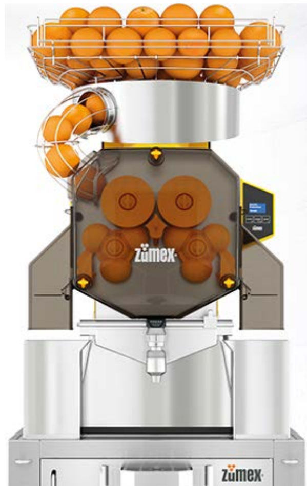
Zumex Speed Pro Self-Service Juicer

In the food and beverage sector, the design and development of new products is a continuous race for innovation. To remain at the forefront of the industry, Zumex invested in a vacuum casting machine that freed the company from third party time constraints and allowed it to test and tweak designs faster than ever before.