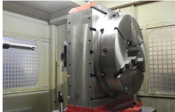
High-precision motorised arm mounted on Trevisan turning machine

The arm is available for machine chuck sizes from 6 in to 24 in, with stylus configurations for all standard tooling sizes between 16 mm and 50 mm.