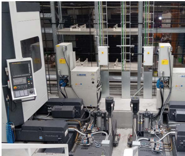
Trevisan machines interfaced in the FMS

By integrating Renishaw machine tool probing systems for the set-up and measurement of valve parts and cutting tools, Trevisan Macchine Utensili has created a flexible manufacturing system for its client that succeeds in maximising precision and productivity.