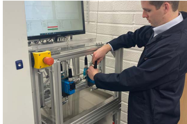
Testing an AM direct drive valve