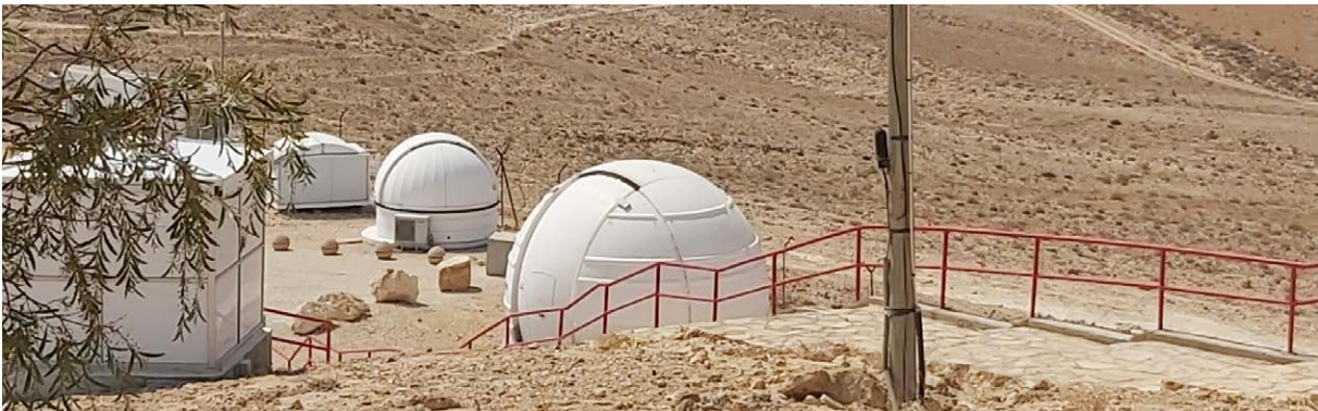
The Wise Observatory, located in the Negev desert in southern Israel

The Wise Observatory is a professional astronomical research facility owned and operated by Tel Aviv University. The observatory is located in the Negev desert, near the town of Mitzpe Ramon, about 200 km south of Tel Aviv. It hosts a one metre diameter Ritchey-Chrétien telescope, a number of smaller automated telescopes, as well as instrumentation for geological and atmospheric research.