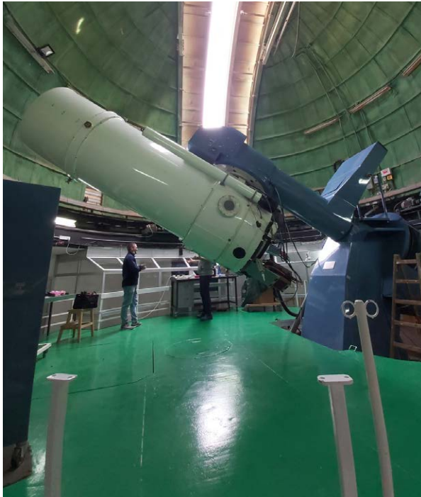
One-metre main telescope at the Wise Observatory