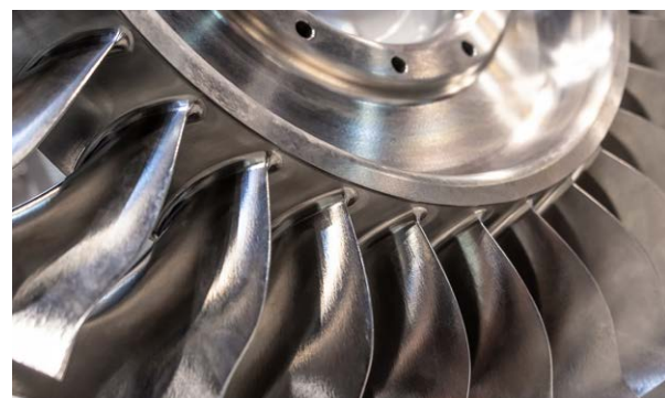
Example of a bladed disk with high curvature surfaces

Bladed disk milling usually involves rough slot-milling and semi-finishing to create a near net component, followed by fine milling to arrive at the finished high-precision blade and rotor surfaces.