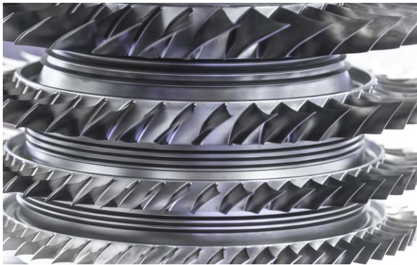
Multiple blades require a fast measurement system

The company deduced that the off-machine inspection and milling process was accounting for anywhere between 30% and 60% of the total labour cost involved in bladed disk production. In addition, statistical analysis of the dimensional deviation in blades (after leading and trailing edge machining) identified the presence of errors.