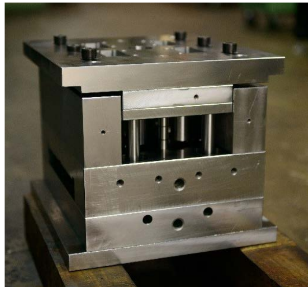
A mould base from GM Enterprise

GM Enterprise's investment in Renishaw equipment and the increased production capability it has delivered has been warmly received by both customers and staff. The company is now producing around 2,500 mould bases every year and has placed an order for a further three CNC machine tools, each specified with a Renishaw GUI and tool setting probes.