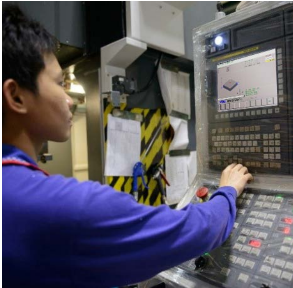
GM Enterprise operator using the Renishaw on-machine GUI