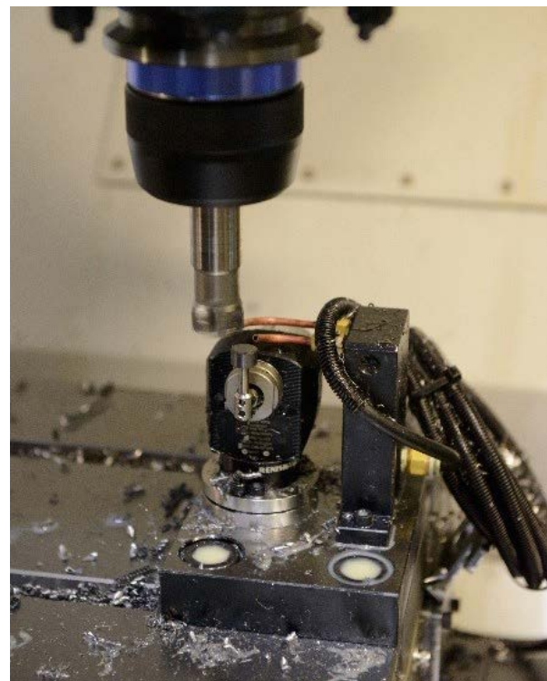
RTS tool setting probe

He commented, "As soon as we started using the GUI, our design engineers were able to get back to focusing their time on program development, leaving CNC machine tool operation to the operators. We were able to work more efficiently."