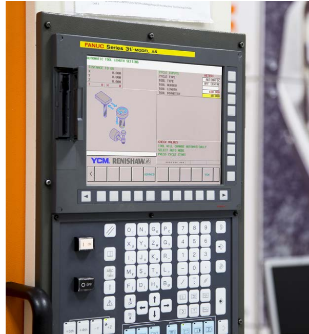
Renishaw GUI on a Fanuc controller

GM Enterprise's first radio transmission tool setters, the RTS probes added greater installation flexibility and unrestricted machine movement, with the probes providing both broken tool detection and rapid measurement of tool length and diameter at \pm 1 \mu\text{m} repeatability.