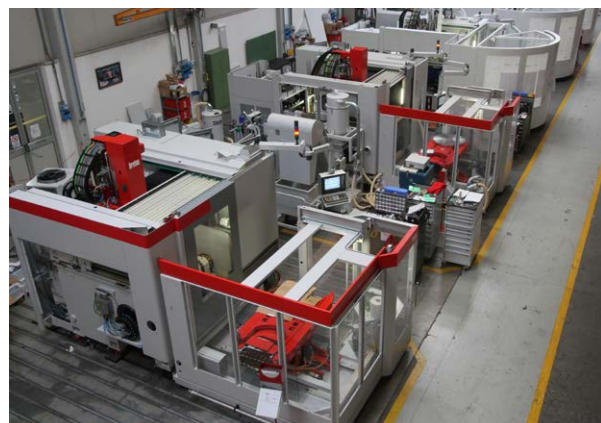
Breton's machine shop

Once staff in the maintenance division, who already used a ballbar system for their periodic checks, showed others how easy to use and accurate the system was, it became a standard tool in every part of the company needing calibration controls.