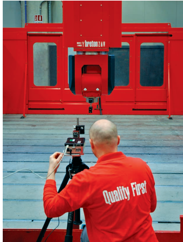
Breton employee using XL-80 laser interferometer

The Renishaw XR20-W rotary axis calibrator is used to check rotary axis errors, "The rotary axis test, carried out with Renishaw's XR20-W, is much better now because unlike our previous control methods, Renishaw uses a reliable interferometric approach to make these tests.