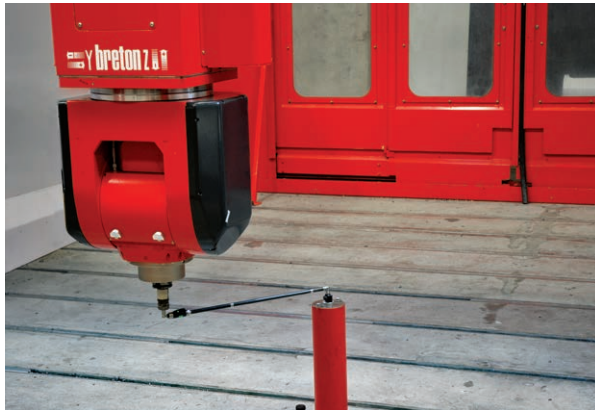
Breton uses the Renishaw QC20-W ballbar to check machine positioning performance

Prior to adopting the latest technology from Renishaw, Breton calibrated its machine tools before shipment using the ML10 laser for linear compensation of CNC axes, and a laser system from another supplier to capture straightness data on machine guides. However, Breton experienced several problems on axes over four meters, where metrology data was inconsistent.