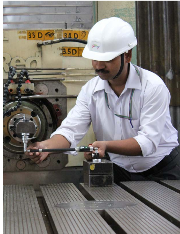
QC20-W ballbar test set-up in Godrej manufacturing facility