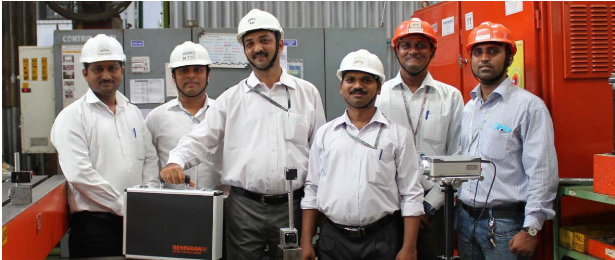
Godrej technical personnel after successfully completing their calibration training

For more information visit, www.renishaw.com/Godrej