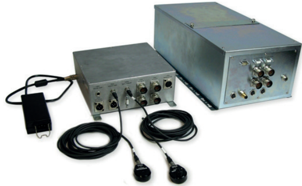
2-axis HC20 system

The updated components and design of HC20 also delivers additional operational benefits over the original HC10 compensation system.