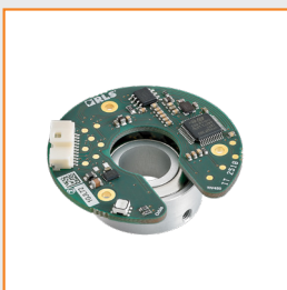
Orbis true absolute rotary encoder