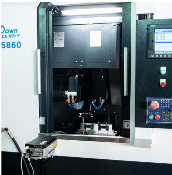
XL-80 laser interferometer system used to check dynamic accuracy of Dawn Machinery's machine tools

The commercial success of building custom-made machine tools requires careful attention and efficiency. Error inspection and correction during assembly needs to be fast and accurate, while labour costs have to be minimised. Faced with increasing customer demand, Dawn Machinery Co., Ltd (Dawn Machinery) chose to replace its traditional granite square and dial indicator metrology in favour of Renishaw's XK10 alignment laser system.