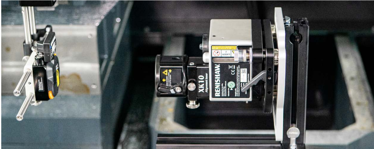
Flexible setup using XK10 fixturing kit