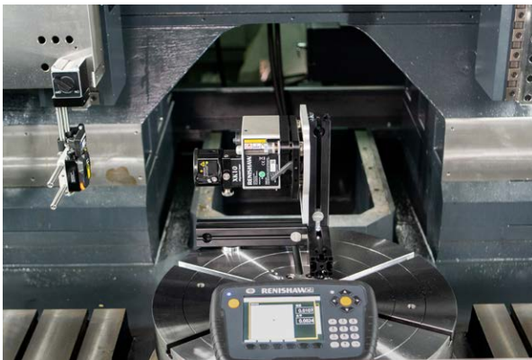
Squareness measurement with XK10 alignment laser system