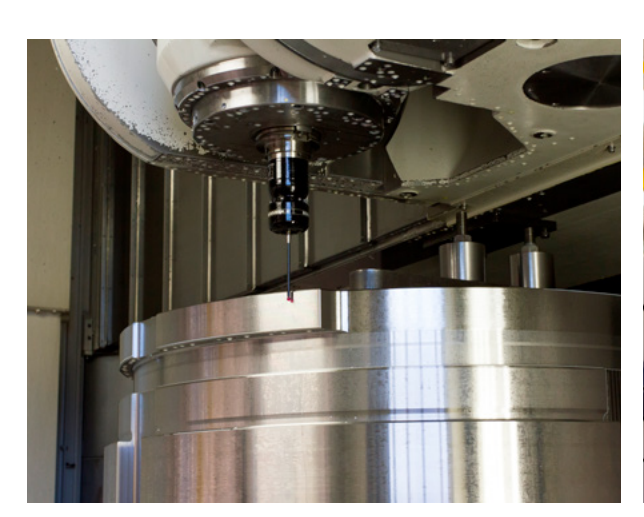
Intoco use Renishaw probing systems to measure large components during the manufacturing process

Mr. Parkins explains: "originally the Mazak Integrex e-650H was delivered without a Renishaw touch probe. However, we required it to machine components up to 1000 mm diameter, which were difficult to measure with conventional inspection equipment. We then contracted Renishaw to fit a touch probe with a radio signal transmission to enable Intoco to inspect and record tight tolerance dimensions."