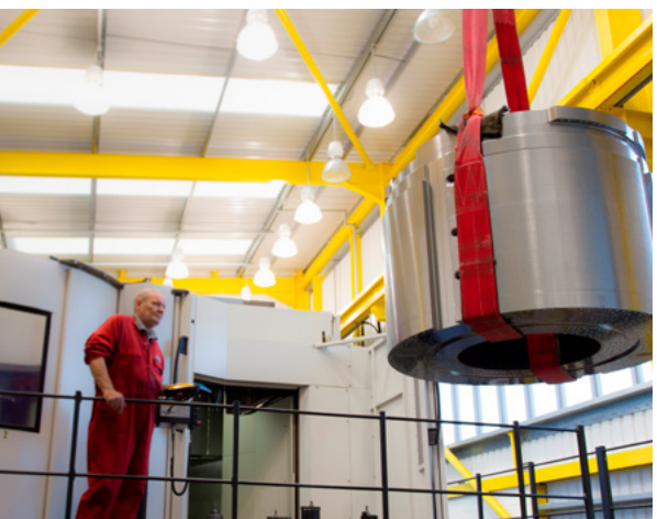
Intoco uses a Mazak INTEGREX e-1850V to machine components with large diameters