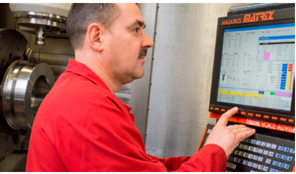
Intoco uses Renishaw's machine tool probing systems on its Mazak INTEGREX machine tools

"Inspection Plus is great because you can do in-process