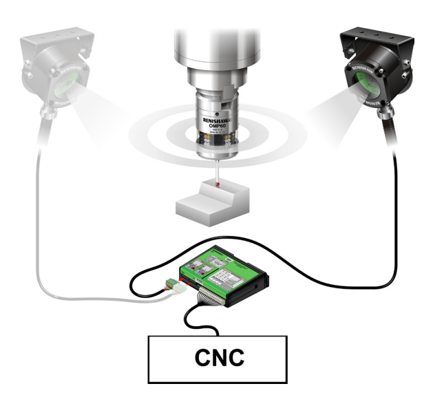
Figure 3: OMM-2 with OSI shown with an optional second OMM-2

Renishaw modulated transmission protocol is an extremely robust system. Under testing and in use it has proven to be highly immune to interference from sunlight and fluorescent light sources. The coding mechanism ensures it is extremely unlikely that a fluorescent light source will emulate a probe signal, while further detection and rejection coding methods provide additional protection.