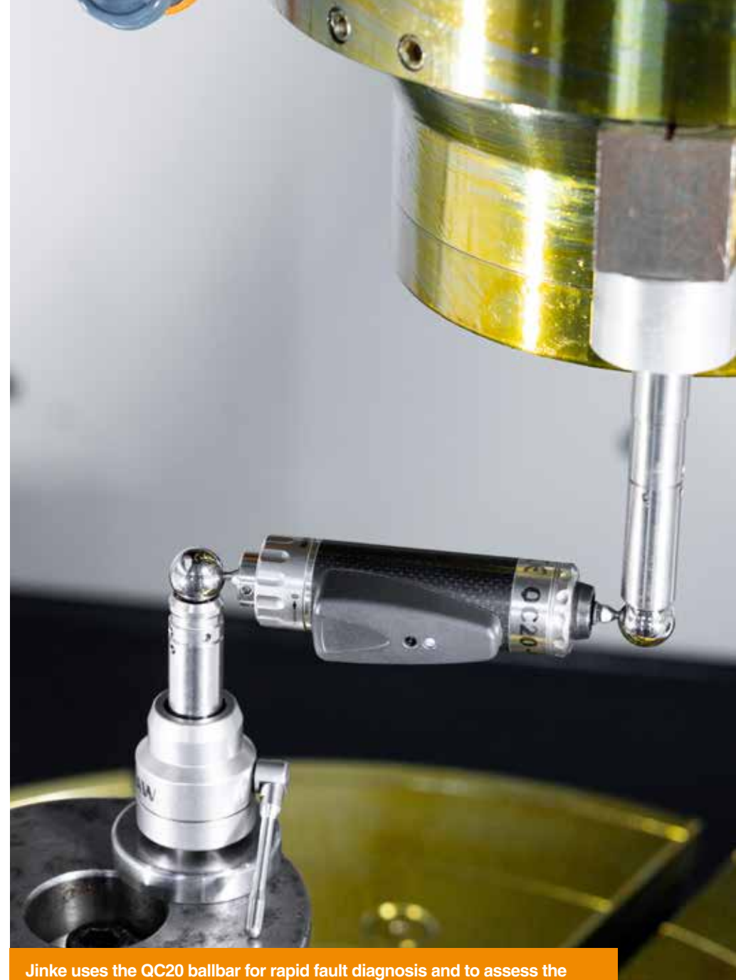
Jinke uses the QC20 ballbar for rapid fault diagnosis and to assess the overall accuracy of machine tools.

The Renishaw QC20 ballbar, in combination with Ballbar Trace software, allows for rapid verification of the accuracy of five-axis machine tools according to international standards, such as ISO 10791-6. This standard aims to verify the kinematic accuracy of four-axis and five-axis machines with three linear axes and one or two rotary axes. The tooltip tracking tests defined by this standard are performed using the QC20 ballbar. During multi-axis motion, the machine tool will attempt to maintain a fixed distance between the tip of the tool and a specific position on the workpiece. The ballbar measures any deviations between the tool tip and the workpiece and evaluates the contour machining performance based on this measurement result.