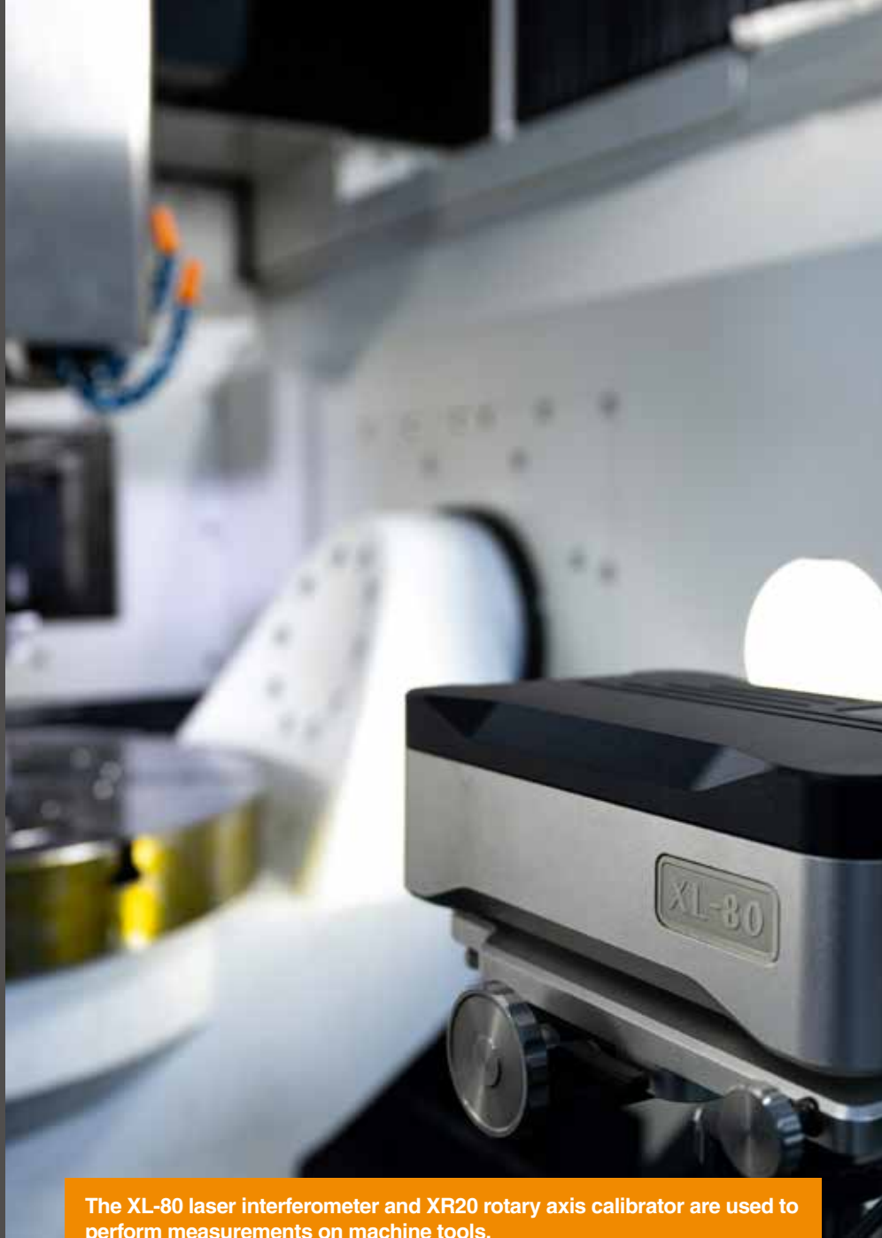
The XL-80 laser interferometer and XR20 rotary axis calibrator are used to perform measurements on machine tools.

Before multi-beam laser calibrators were available, manufacturers used single-beam laser interferometers to measure precision machines and could only measure a single error parameter each time the device was set up. Jinke was no exception to this rule, using the Renishaw XL-80 laser interferometer and XR20 rotary axis calibrator to test their machines. As Technical Director, Mr Shao explains, “Since we began using the Renishaw XM-60 multi-axis calibrator, we have found that it measures more efficiently and simplifies both set up and operation. It can measure errors in six degrees of freedom with a single set-up, including roll angle measurements. The CARTO software quickly analyses the sources of the errors. Using the XM-60 system has increased efficiency by a factor of four or more.”